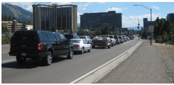
The RPU means more buildings, pavement, and vehicles.

On October 25th, Earthjustice filed an "Opening Brief" on behalf of FOWS & the Sierra Club. Our brief, limited to 25 pages by the judge, focused on three key concerns with TRPA's environmental review of the Regional Plan Update: