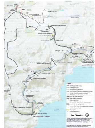
Proposed Alternative (DEIS/DEIS/DEIR)

This project, which would increase the capacity to supply power to areas of North Lake Tahoe, Northstar, Truckee, and Squaw Valley, lays the foundation for major resort expansions, including proposals to bring Disneyland-like theme parks to the mountains, cutting down trees for rollercoasters and building large luxury homes for guests. The CalPeco Electrical Line Upgrade - an expensive project that will benefit resort expansions at the expense of our environment and pocketbooks - will be paid for by all Liberty Energy customers . However, the agencies and project proponents are downplaying the project's objective, instead suggesting that this upgrade is necessary to maintain reliability for existing energy customers. The facts show otherwise. Learn more about the CalPeco project and help by telling the agencies what you think!