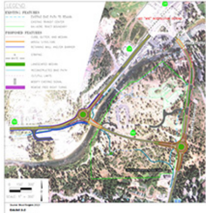
Example of Alternatives Studied (Alt. 1)

The environmental documents examine seven project alternatives and are available online .