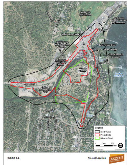
Fanny Bridge/S.R. 89 Realignment Project Map

FOWS will be submitting comments on the document, as we are concerned about the potential for several impacts, including possible increases in traffic on the West Shore. Several West Shore community members have also expressed concerns about the project. We encourage you to attend the meetings and/or submit comments.