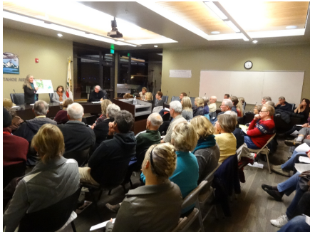
From: 12/9/2014 public meeting in Truckee.

However, concerns about the development of this ridgeline aren't reserved to just Lake Tahoe communities; in fact, members of the public in Truckee are concerned about such development as well. As a result, another public meeting was held in Truckee on December 9th to discuss the project with an estimated 70 people in attendance. In addition, residents in Truckee and the larger North Tahoe area are concerned about the impacts of other multiple developments in the works . It has been exciting and encouraging to see the efforts of these community members result in broader community engagement and participation!