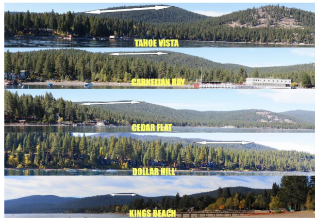
Project Area from locations in North Lake Tahoe (Image by: GK Consulting)

There are numerous problems with the DEIR, many of which are likely to underestimate the negative impacts to the Lake Tahoe Basin, including traffic and scenic quality. In addition, the DEIR fails to evaluate the cumulative impacts of the MVWPSP with the Brockway Campground, a 550-unit campground proposed by the same developer immediately adjacent to the MVWPSP. FOWS and the Tahoe Area Sierra Club submitted detailed comments regarding these deficiencies and requested the DEIR analysis be corrected and the DEIR recirculated. Other organizations and citizens also identified similar problems and requested recirculation, including but not limited to the League to Save Lake Tahoe, Mountain Area Preservation and Sierra Watch, North Tahoe Preservation Alliance, and Sierra Club (Mother Lode Chapter). Comments have been posted on FOWS' website .