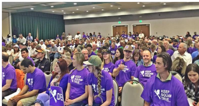
Attendance at the 8/11/2016 Planning Commission hearing.