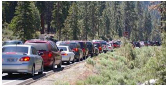
The Tahoe Basin Area Plan will increase traffic.