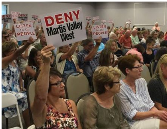
Over 300 people attended the 7/9/2016 Planning Commission hearing.