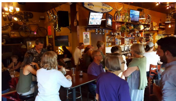
We had a wonderful evening celebrating West Shore communities at West Shore Pizza in Tahoma!

That said, we all need to take time to celebrate our efforts as well; to spend time together, relax, and honor victories large and small - and even better, to do so over delicious pizza! On August 17 FOWS held a Community party and fundraiser at West Shore Pizza where many old and new friends joined together for a fun and relaxing evening. We would like to thank West Shore Pizza for providing the space for our event as well as wonderful food and service, and all who attended and donated funds toward FOWS' efforts. We could not continue to represent the West Shore without your support!