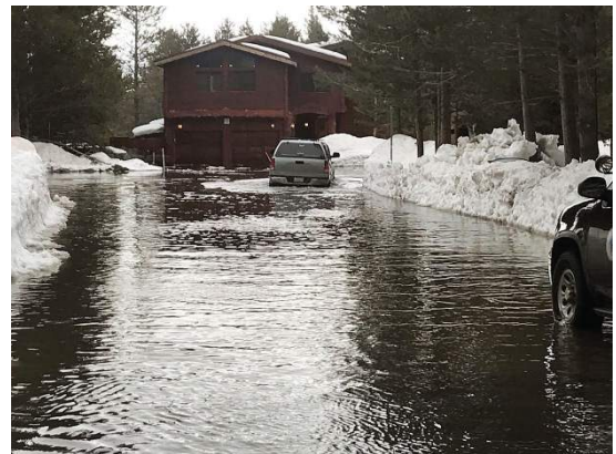
Climate change will mean more flooding in the Basin. Image from February 2017.

FOWS will continue to advocate for the adoption of adaptive strategies and more responsible land use planning.