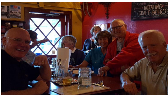
It was a fun celebration at our community party!

FOWS will continue to advocate for the adoption of adaptive strategies and more responsible land use planning.