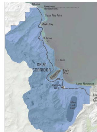
Figure 3: SR 89 Corridor

As expected, the existing conditions report documents extensive congestion and parking management issues at Emerald Bay, Camp Richardson, and nearby areas (e.g. Pope Beach). Congestion along other areas of the West Shore (e.g. Rubicon Bay, Meeks Bay, Sugar Pine Point) is not as extensive as areas to the south, but there are some issues to consider, especially with regards to the location of the future bike trail from Meeks Bay south to Emerald Bay. The report also identifies where visitors are coming from, how long their visit will be, and other factors that will affect what types of future actions may be most beneficial to reduce traffic impacts. FOWS will continue to participate in stakeholder meetings and keep you updated.