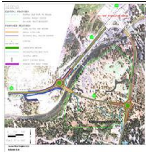
Examples of Alternatives Studied (Alt. 1)