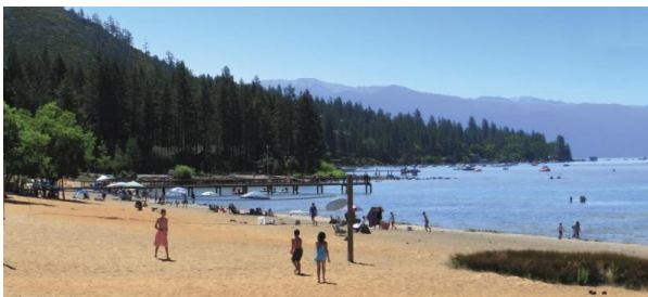
Kings Beach Recreation Area

The California Department of Parks and Recreation and the California Tahoe Conservancy are preparing a revised General Plan that will guide the long-term management of the Kings Beach State Recreation Area (SRA). Proposed revisions include a reconstructed Kings Beach Pier.