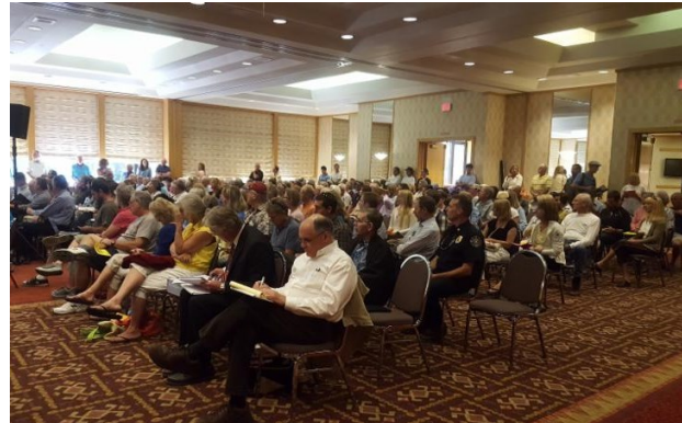
Over 200 people attended the June 9 Planning Commission hearing regarding the Martis Valley West Parcel Specific Plan.

Public participation in our planning processes does matter and can have an impact, even though it may feel very discouraging sometimes. As our economy recovers, we once again find the Tahoe Basin threatened with massive developments. But communities are rallying together to have a say in the future of our area, and our local representatives appear to be listening: